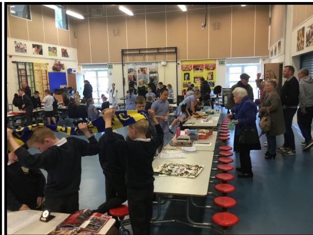
Photographs of Year 4 projects. Year 3 on page 2.